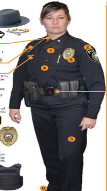
Department of Navy (DON) Police