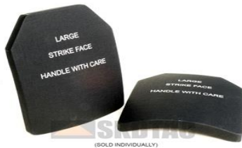
ESAPI Plates (Level IV Protection)