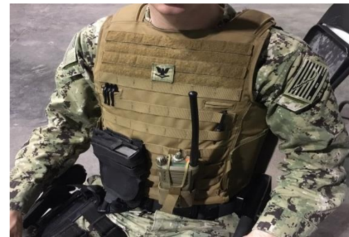
Tactical Outer Carrier (TOC) (Coyote Brown)