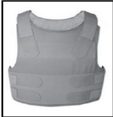
Concealable Body Armor (CBA) (Second Chance Vest)